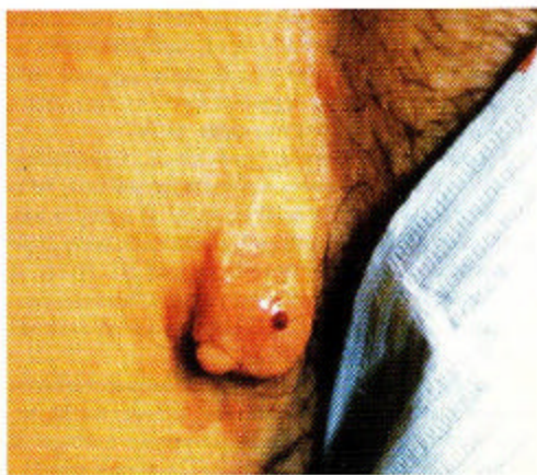
FIGURE 1. A 3-cm by 2.5-cm rock-hard, flesh-colored, dome-shaped, nontender, subcutaneous nodule in the right inguinal area.

REPRINT REQUESTS to 1427 67th Street, 3rd Floor, Brooklyn, NY 11219 (Dr. Levit).