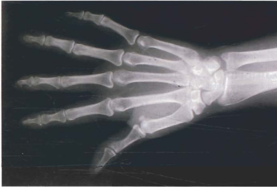
Figure 4. Tapering of soft tissues of right second and third fingers with tuft erosion.

cells, and vacuolated keratinocytes. Absent granular layer and central areas of liquefaction degeneration with colloid body formation are seen, in addition to upper dermal lymphocytic infiltrate. 6