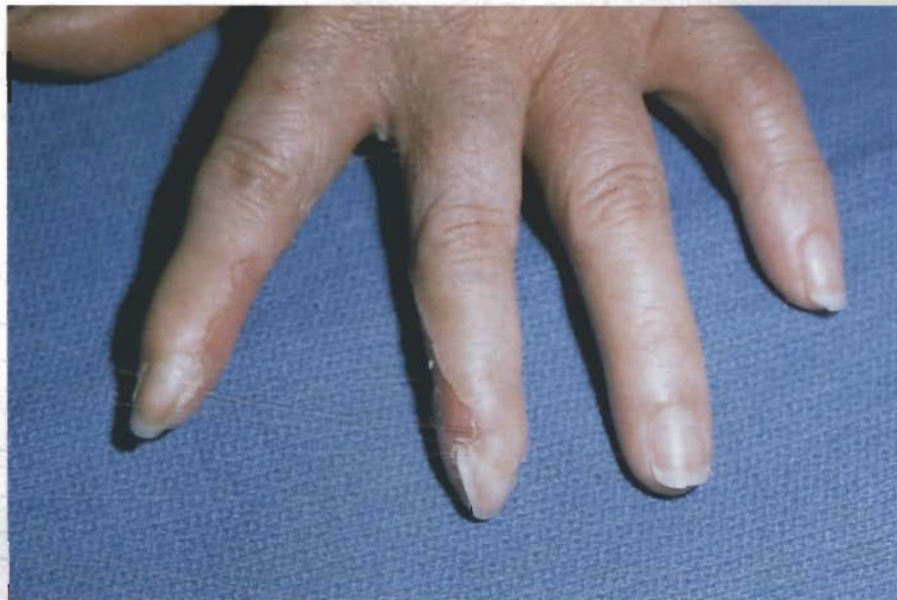
Figure 2. Distal narrowing and nail dystrophy with overlying skin lesions.