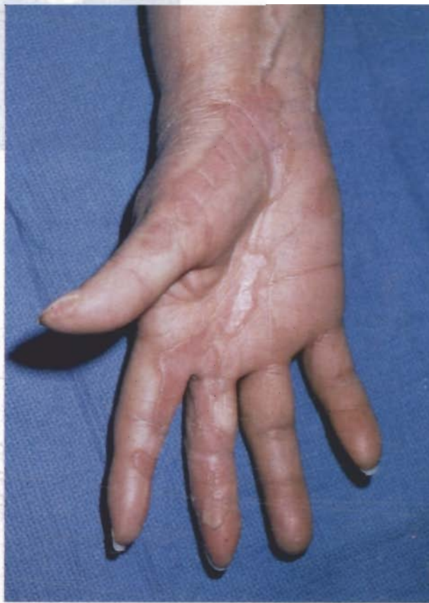
Figure 1. Linear erythematous plaques with central atrophy and raised borders.

A 58-year-old woman presented with a 20-year history of hyperpigmentation and erythematous fissuring of her right hand. Examination revealed linear erythematous plaques with central atrophy and rolled borders on the right palm extending to the palmar and lateral surfaces of the thumb and second and third fingers. The second and third fingers also demonstrated distal narrowing with nail dystrophy and limited extension (Figures 1 and 2). Linear hyperpigmented patches were seen on the extensor surface of her right forearm and upper arm.